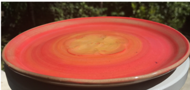
LC72 Sunshine Side Plate W: 19 cm H: 2 cm EC$ 90