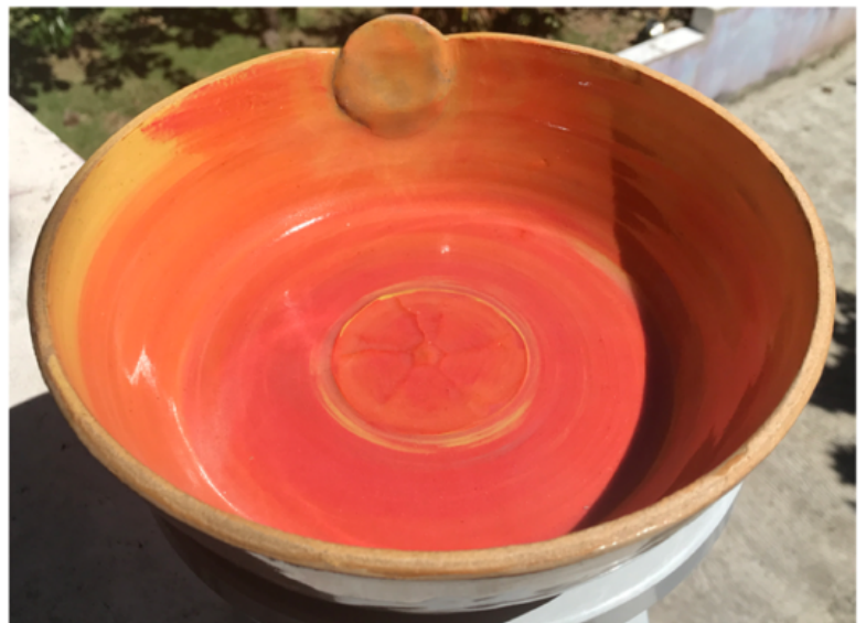
LC73 Sun Fruit Bowl (Medium) W: 21.5 cm H: 6.5 cm EC$ 140